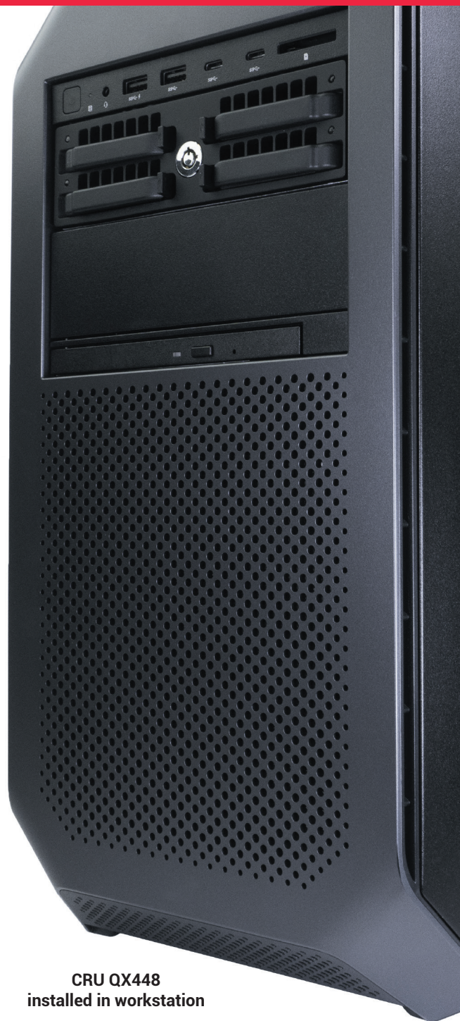
CRU QX448 installed in workstation

A SHIPS-compliant module is interchangeable among a variety of device types, from edge/IoT to desktop to custom systems. CRU will provide engineering details to developers designing custom systems.