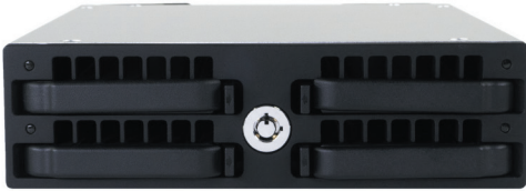
Four-module CRU Qx448 device for standard 5.25" bays, built to withstand tens of thousands of opens