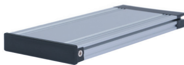
DIGISTOR Q80 NVMe module