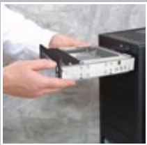
DE75 receiving frame fits in any standard 5.25" HH bay