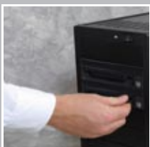
The DE75 Also Accommodates Undersized or Custom Bays