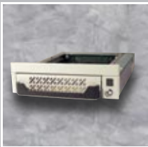
Available in Beige and Black