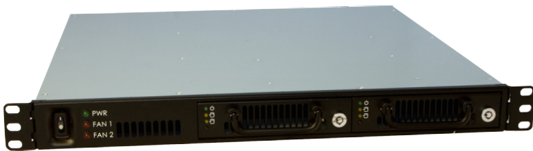
DataPAK with Multilane SAS/SATA interface