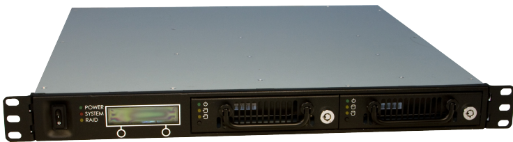
DataPAK with Quad RAID interface

Enclosures with Multi-Drive DualPAK™ Removable Carrier