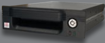
IDE-to-Serial ATA DataPort Carrier