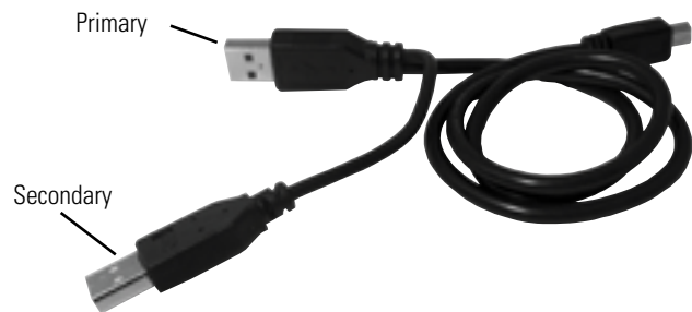
Figure 2: Dual Connector USB Cable